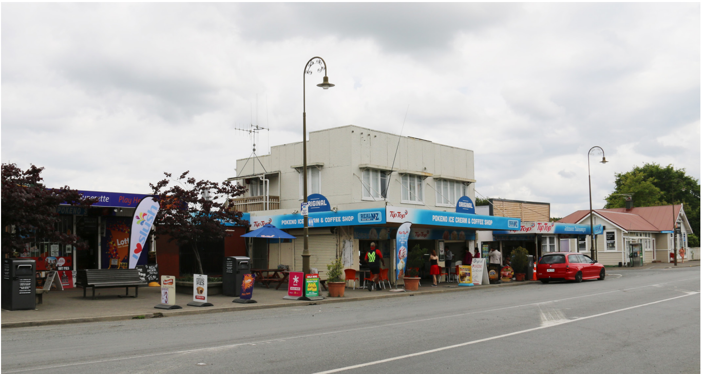
Existing retail strip along the southern side of Great South Road - illustrating active frontages, provision for outdoor dining, continuous verandah cover and small scale built form