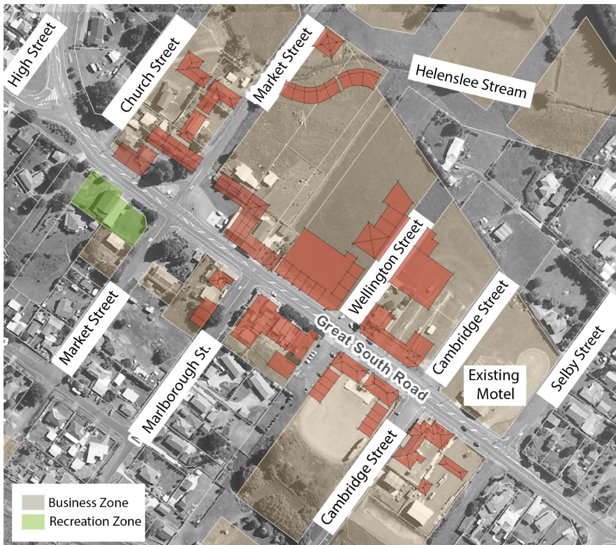
Above Aerial photograph of Pokeno's town centre/Great South Road showing existing Business and Recreational zoning (as at July 2015) and overlay of potential building layout as depicted in Appendix 29.2 of the District Plan.