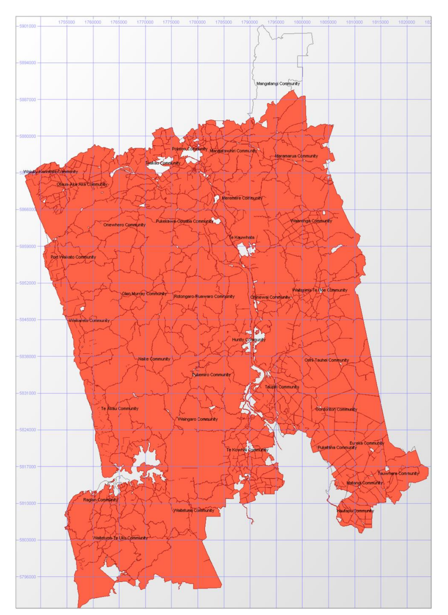
Figure 2.1: Preferred Option Geographic Extent – Total Rural Zone

The following map is a representation of the Rural Zone geography of the preferred option (as used to run the Baseline Database for this report) — that is, where it has effect on the ground. Based on the approach taken, this option has a direct effect on 'many large areas (extensive but not total district)'. Note, this map should not be relied upon for understanding this policy for specific properties within the District.