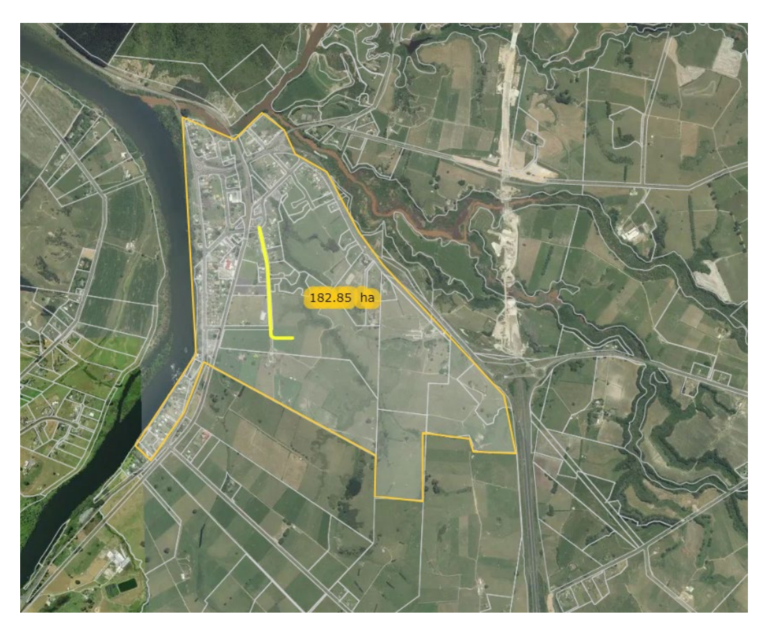
Taupiri Current and Future urban Area

Currently Taupiri represents a urban area with an area of 182.85 ha. – this includes all residential and future urban zoned land.