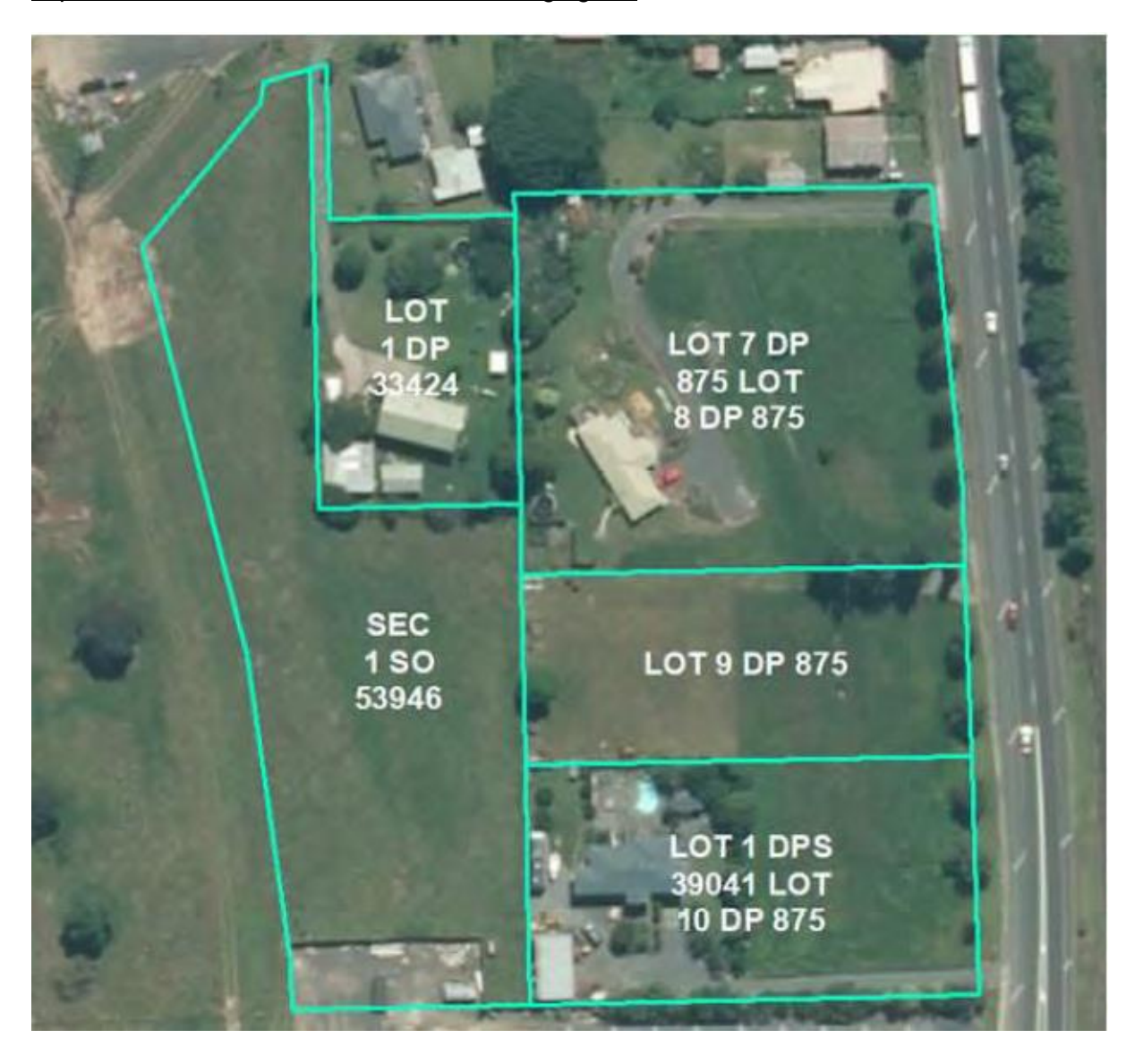
Figure of the Builtsmart Expansion Area (or similar) to be Inserted into the Waikato District Plan.

"Builtsmart expansion area" means the land contained in Lot 10 DP 875, Lot 1 SP South Auckland 39041, Lot 9 DP 875, Lot 1 Deposited Plan 33424, Lot 7-8 Deposited Plan 875, and Section 1 Survey Office Plan 53946 (or any future legal description). The Builtsmart expansion area is also shown in the following figure.