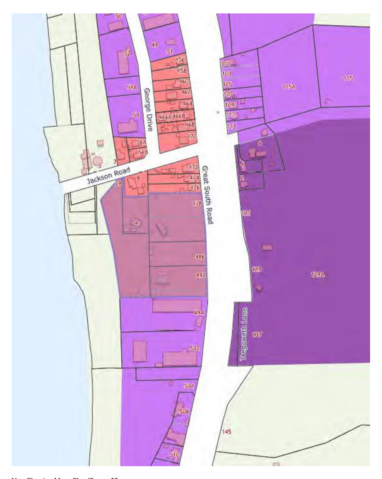
Appendix 3 – PPC22 Builtsmart Zoning Map