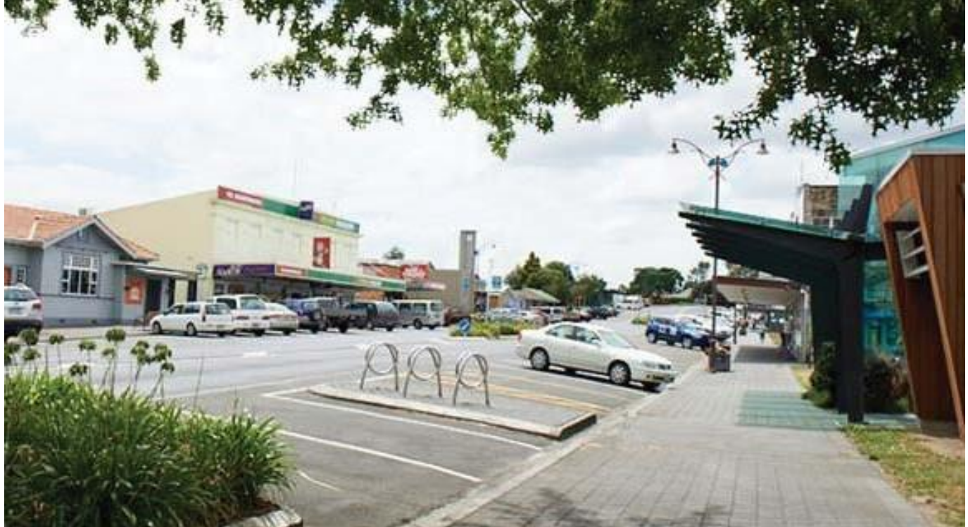
View looking north-east down Main Road, with the Library in the foreground.