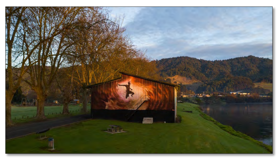
The Point, Ngaaruawaahia

Council recognises the limited resources of community groups occupying reserves and notes some existing reserve facilities could sustain higher levels of use, and the sharing of such facilities would prevent unnecessary duplication and cost. Pre-approved sub-letting (or hubbing situations) of facilities by lessees can generate revenue and spread the load of paying for overheads such as power. Such uses must however be consistent with the purposes for which the reserve is held.