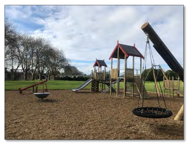
The Point, Ngaaruawaahia

'Play' has a broad definition with many concepts that help facilitate play. Technology and concepts such as 'nature play' and 'play-on-the-way' can be affordable to implement and make a positive difference to how our community interact with their open spaces. It is important that our reserves continue to evolve, where practical, to cater for all play options.