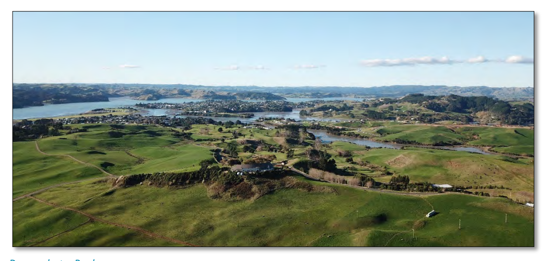
Drone photo, Raglan

The Council has issued a code of conduct (located on the website) which users must adhere to receive permission to operate from a reserve. Any activity that does not follow the code of conduct must be applied to Council, in writing. Further information is available on the Council website.