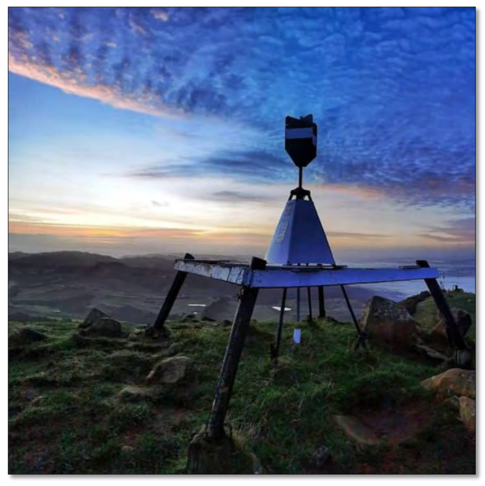
Mount William Scenic Reserve

The Reserves Act 1977 provides the legal classification system for reserves held under the Act (Appendix 2). This identifies the primary purpose of the reserve and the statutory framework for managing the reserves. Because the classifications are high level, Waikato district reserves are also grouped into different management categories, which have been developed by the Recreation Aotearoa (Appendix 2). The categories include Civic space, Cultural heritage, Neighbourhood, Outdoor adventure, Nature, Public gardens, Recreation and ecological links, and Sports and recreation. These reserve categories are compatible with the Reserves Act Classifications but provide a more detailed framework that recognises the more specific function and character of each reserve and assists with the planning and management, including the level of service applied to the reserves (e.g. a sports and recreation reserve has a high level of built infrastructure and level of maintenance, whereas a natural bush area has low levels of infrastructure and different maintenance activities).