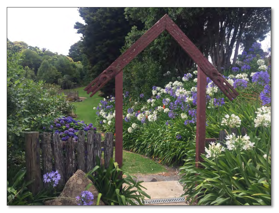
Tuakau Centennial Park

Council may require that any public art be accompanied by a landscape assessment, detailing how the public art will fit within the proposed setting. Art may also be received as a gift to the community. In this scenario, a written agreement will be established with Council and the 'gift giver' on the acceptance or decline and suitable location of the art piece.