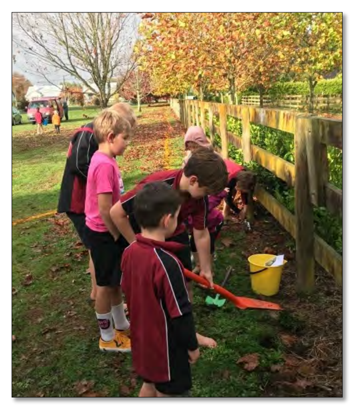
Jack Foster Reserve

The threat of pathogens, such as kauri dieback and myrtle rust, spreading through the Waikato district may need to be actively managed in the near future. In some circumstances recreational access may need to be restricted through the closure of tracks, or quarantining zones or raahui to protect areas within reserves to contain areas of infection to prevent the spread of disease.