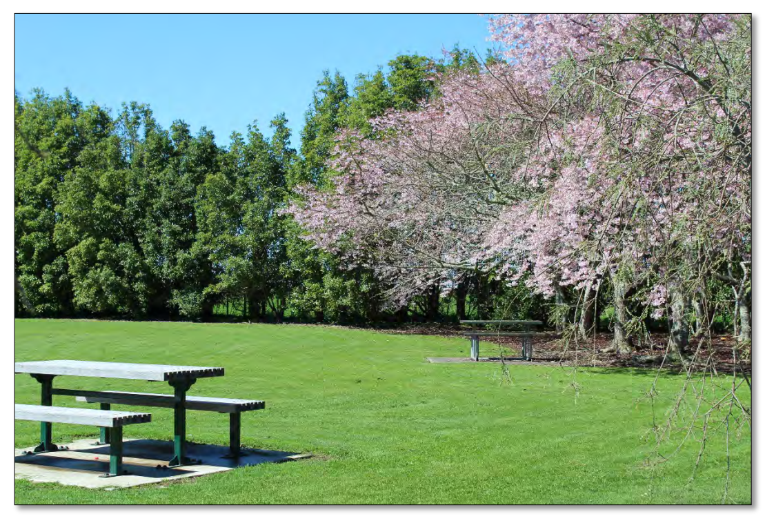
Te Kowhai Reserve

Waikato District Council is responsible for managing local reserves within its area.