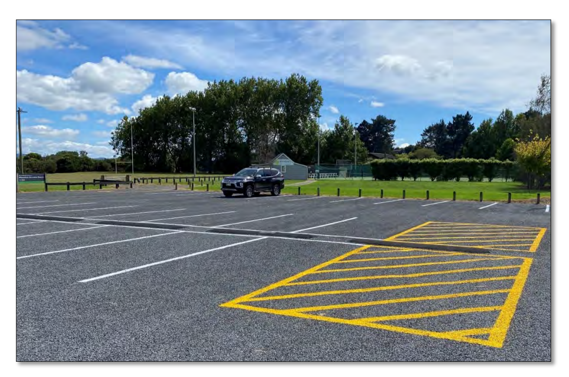
Whatawhata Recreation Reserve