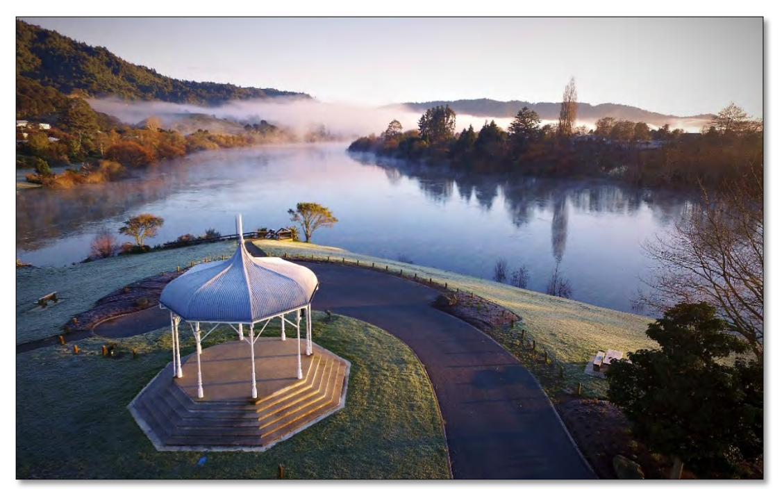
The Point, Ngaaruawaahia