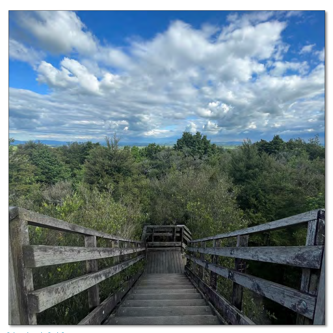
Pukemokemoke Bush Reserve