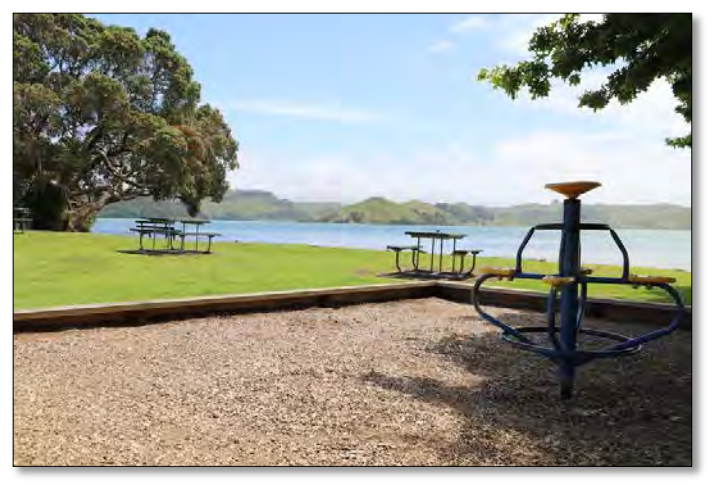
Puriri Street, Raglan

Some reserve users may wish to commemorate loved ones who have had a connection to a reserve location. Where commemorative assets are proposed, Council will assess each application against the Memorials, Plaques, and Monuments Policy.