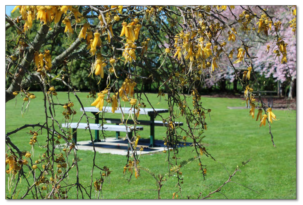
Te Kowhai Reserve