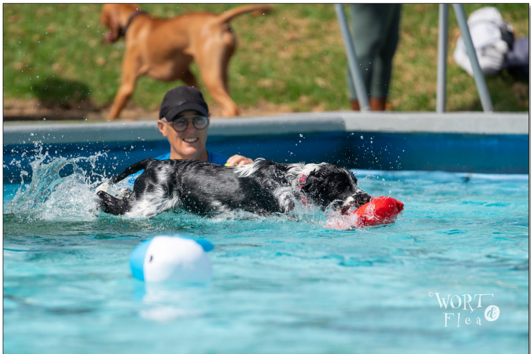
One of our Animal Control Officers at the Pound Pups Pool Party in Tuakau

The Waikato district covers more than 400,000 hectares – both rural and urban. In the past 5 years the known numbers of dogs in our district has increased each year. This reflects the continued growth in our communities. There were 16,016 known dogs in the Waikato district, as of 30 June 2023. This is an increase of 264 dogs from the previous year. Approximately 11.7% of the registered dogs in our district are registered on a Farm Owner Policy.