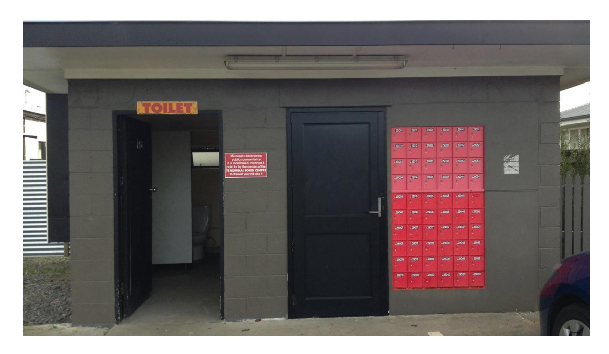
Figure 4: Te Kowhai Shops