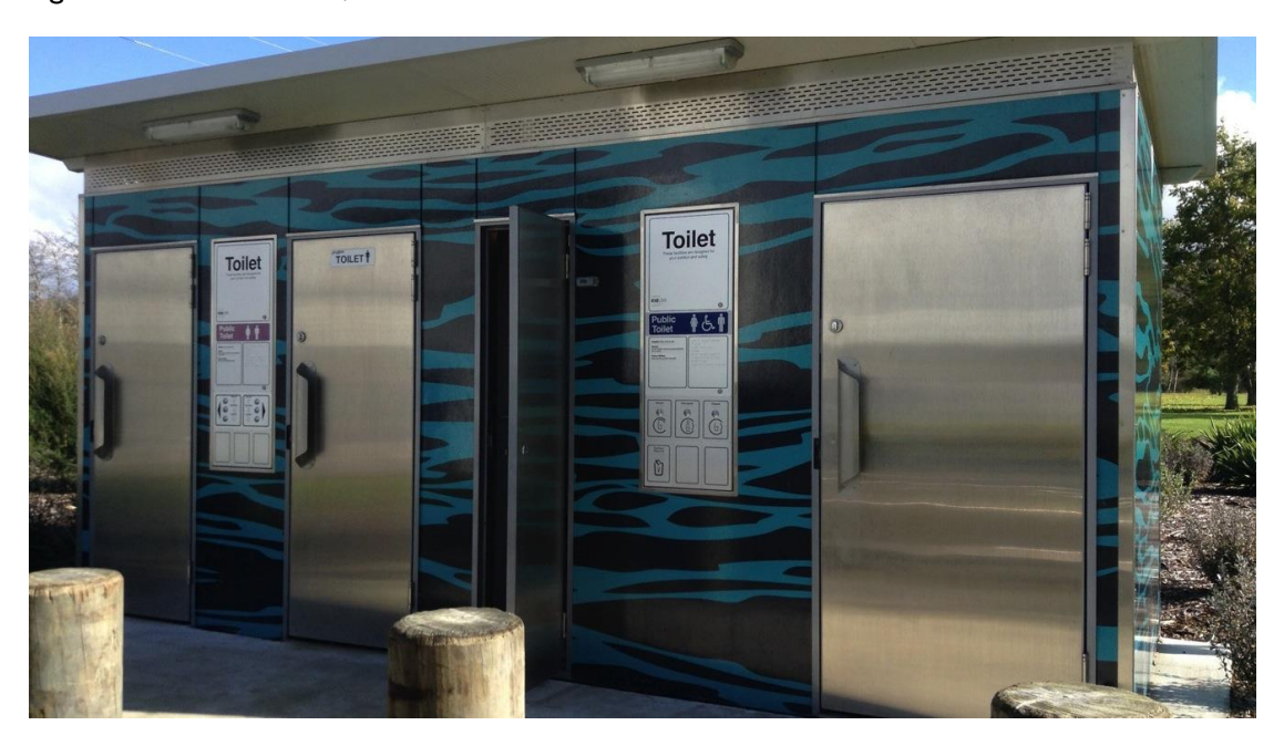
Figure 3: Elbow Reserve, Aka Aka

While these toilets also tend to have higher maintenance costs (principally with door mechanisms) they provide a high level of service and are robust and vandal resistant.