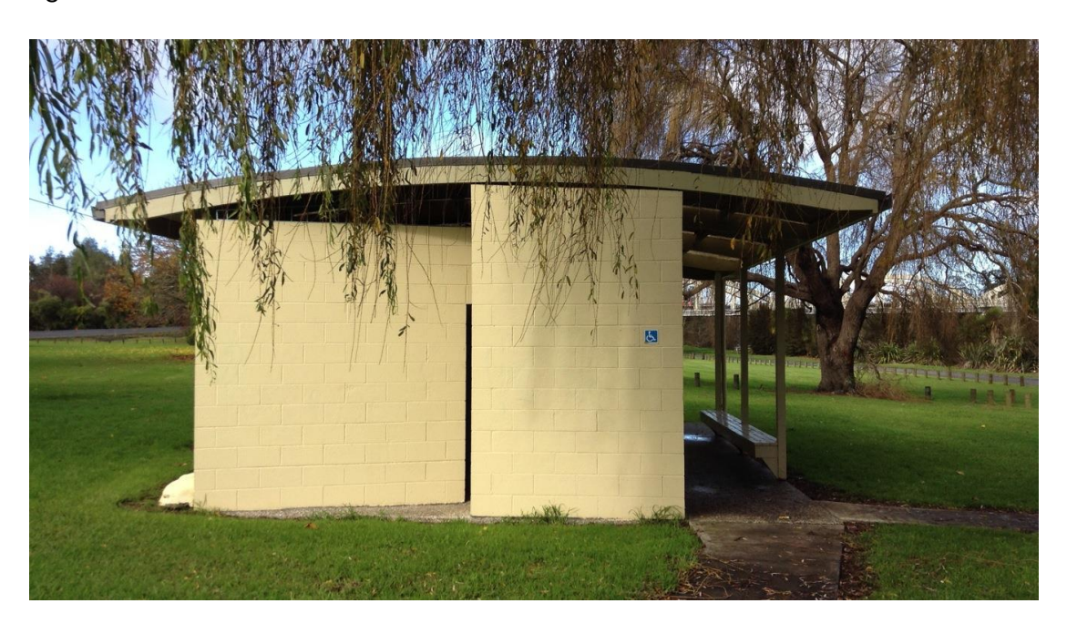
Figure 5: Les Batkin Reserve, Tuakau

Standalone toilets are the most common type of toilet provided and are generally older style toilets. These tend to have a large building footprint and separate facilities. Often facilities are over scaled for actual use. In most cases a modern all-gender, two-unit toilet facility would cope with the majority of demand with acceptable levels of queuing.