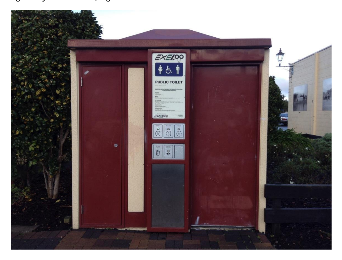
Figure 2: Jesmond Street, Ngaruawahia

These automated units were installed between 1997 and 1999 and are now nearing the end of their economic life, and while they are functional as public toilets, the servicing and maintenance requirements is such that they are becoming increasingly uneconomic to operate.