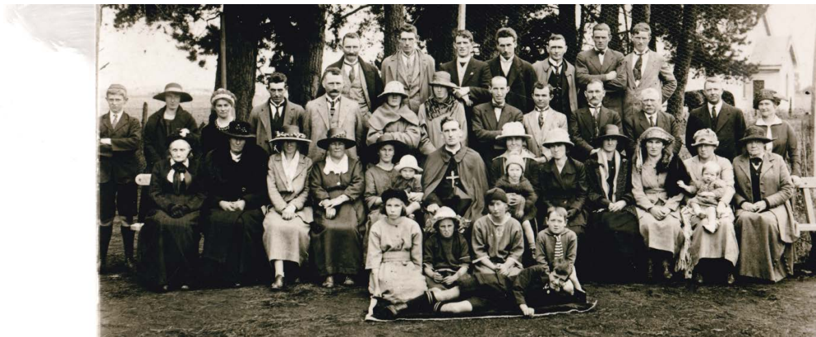
The congregation of the Te Kowhai Catholic Church, at the original public hall, in 1920.