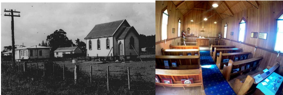
The Saint Stephen's Church was carted by truck to the new central village area in 1955. Right: a 2016 photo of the church's interior.

1950. By this time, the central village of today had begun to prosper and it was proposed to shift the church from its lonely location 'out west'. This was done in 1955 . Victor and Ethel Henton made available land from their farm to the new church site.